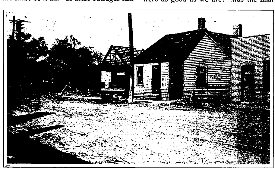
NEGRO HOMES. The three to the right were looted, the three to the left were burned.

For the underlying motive of the mob and of that large portion of Springfield's population that has long said that "something was bound to happen," and now approves of the riot and proposes to complete its purpose by using other means to drive as many as possible of the remaining two-thirds of the negroes out of town, was confessedly to teach the negroes their place and to warn them that too many could not obtain shelter under the favorable traditions of Lincoln's home town. I talked to many of them the day after the massacre and found no difference of opinion on the question. "Why, the niggers came to think they were as good as we are!" was the final