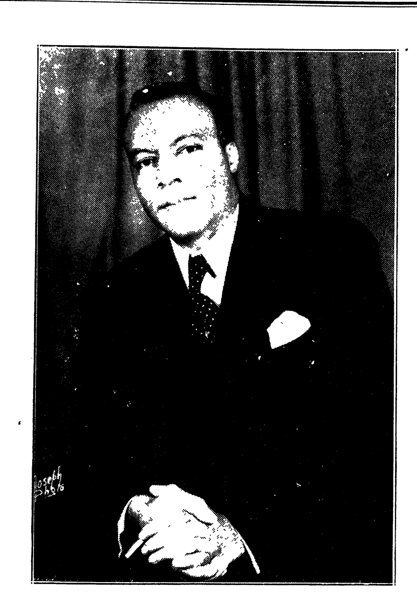
A. PHILLIP RANDOLPH

International President BROTHERHOOD OF SLEEPING CAR PORTERS