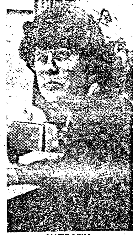
JANET RENO . . . . "this is no-place for politics"

In one of the incidents, two brothers and a women companion, all white, were set upon after a brick crashed through their car window and sent the car swerving into a 75-year-old man and an 11-year-old girl, both black.