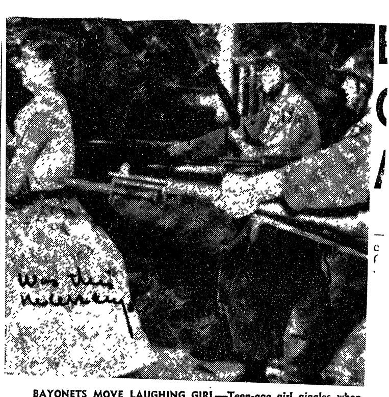
BAYONETS MOVE LAUGHING GIRL—Teen-age girl giggles when troops with fixed bayonets order her to clear sidewalk in front of Central High School in Little Rosk, Ark., today, but it was no laughing matter a few moments later when Negro students were brought into the school, under guard of other federal soldiers with bayonets. (AP Wirephoto).