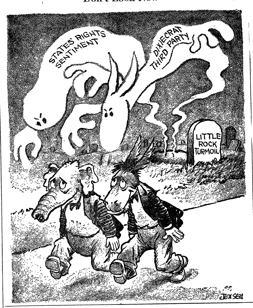
LETTERS TO THE EDITOR