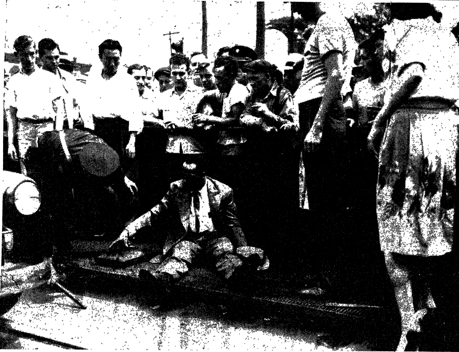
This lone colored salesman armed with nothing but a brief case and doing no harm to anyone, was hauled off a Woodward Avenue car at Mack, Monday, by a white mob who beat him severely. Note the club at the feet of one of the women in the group. (Other pictures on page 16.)