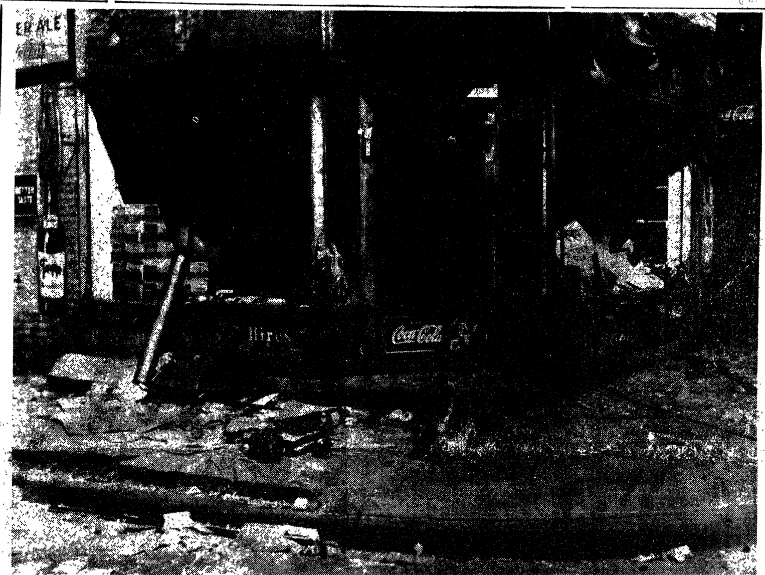
This store at the corner of St. Antoine and Montcalm, a block from Tribune office, was completely wrecked by colored rioters in reprisal for injuries inflicted by white mebs. Hundreds of other stores owned by whites on the eastside were also demolished by colored citizens.