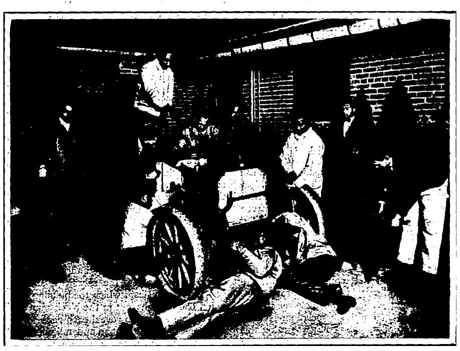
AUTOMOBILE CLASS FOR COLORED MEN AT THE INDIANAPOLIS Y. M. C. A.

It is sometimes said that the Young Men's Christian Association weakens the influence of the church. This was not so in the case of the Negro. In many instances the persons who contributed the most in effort and money to make the erection of these buildings possible were men who had not been counted as particularly religious men. In a great number of cases, after the building campaigns were over, they connected themselves with the