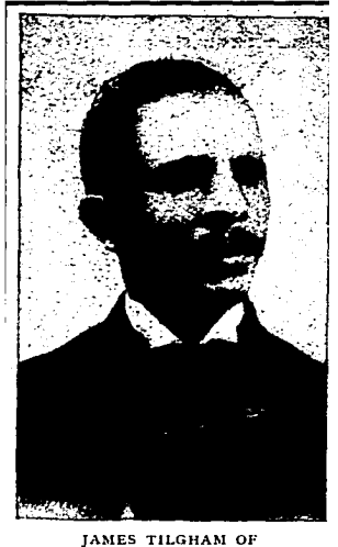
CHICAGO The first colored man to give $1,000 for a Y. M. C. A. Building