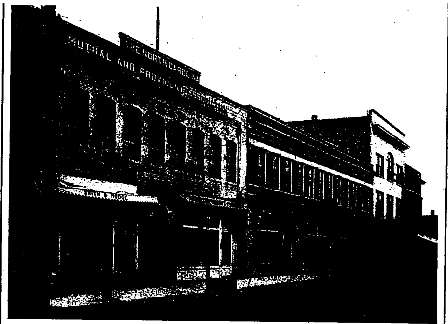
BUSINESS BLOCK OF THE NORTH CAROLINA MUTUAL AND PROVIDENT ASSOCIATION, AT DURHAM, N. C.