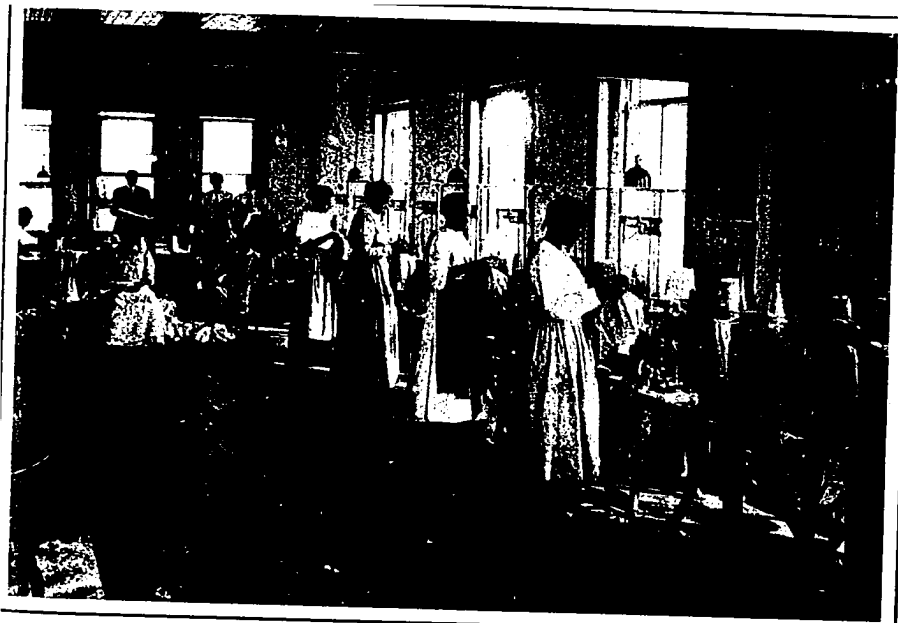
THE ONLY HOSIERY MILL IN THE WORLD OWNED AND OPERATED BY NEGROES.

But with all this prosperity, some doubt still assailed me. The exceptional man is everywhere and among all races. He has always been in evidence among the people of my race. In slavery days one Negro could gain his freedom and himself become a slave owner while his own brethren remained in bondage. These Durham men of whom I am talking had had their opportunities. They had been to college, to medical schools, to dental schools, to schools in the North, enjoy-