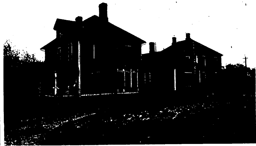
LINCOLN HOSPITAL: A GIFT OF WASHINGTON DUKE.