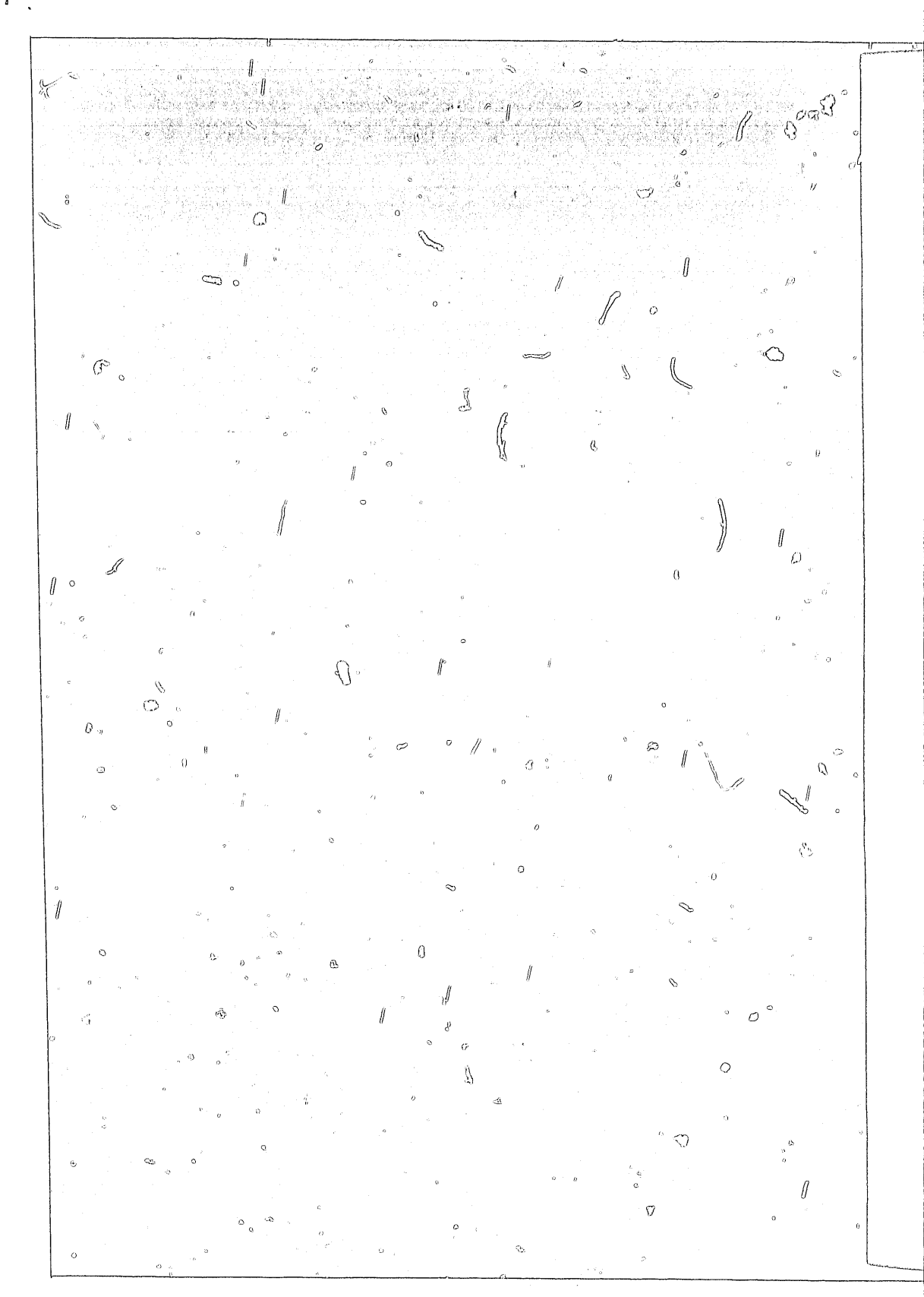
BLEED THROUGH - POOR COPY